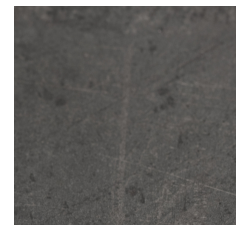
CAVE RAL 7043