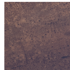
CORTEN RAL 8011